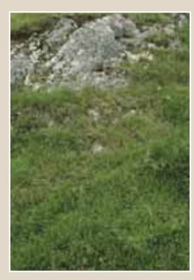
Steep bony parent rocks support rich soil and pasture

medium to high levels, in good ratios, of all the major nutrients; phosphorus, potassium, sulphur, calcium, magnesium and sodium, with phosphorus at 0.48%. Micro-nutrients are also all in the medium to high range, with no deficiencies. The plant digestibility is 75.1% and metabolisable energy 12.2 MJ/kg, providing excellent palatability and digestibility ensuring healthy and productive livestock.