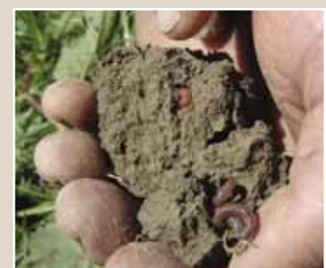
Worms aestivating over summer-dry