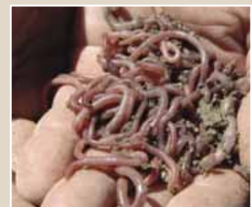
13 million worms per hectare